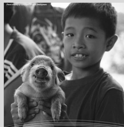
Episcopal Relief & Development Sunday March 10, both services A day to remember those in need