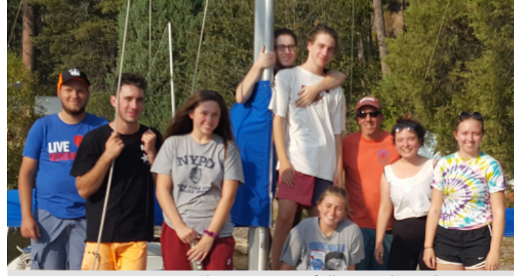
Emmaus students on our fall camping trip