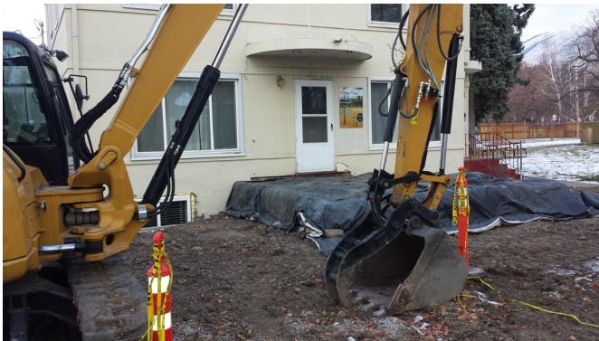
Emmaus house's new porch is under construction and should be completed this spring.