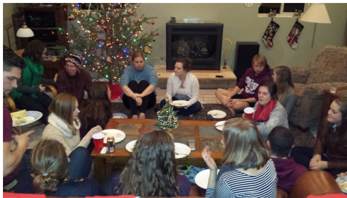
Far Left: Students gather for Wednesday evening worship.